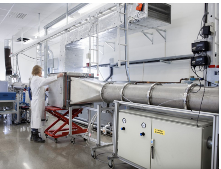
In Camfil's molecular media test rig in Trosa, Sweden, various filtration technologies are challenged with different gases at realistic concentrations against a wide range of temperature, humidity, and airflows.

Effective solutions for the removal of gaseous contaminants must be validated in accordance with ASHRAE 145.2 and ISO 10121-2. Both of these test standards validate the performance of Gas Phase Air Cleaning devices under actual operating conditions. Performance claims made without this compliance are questionable.